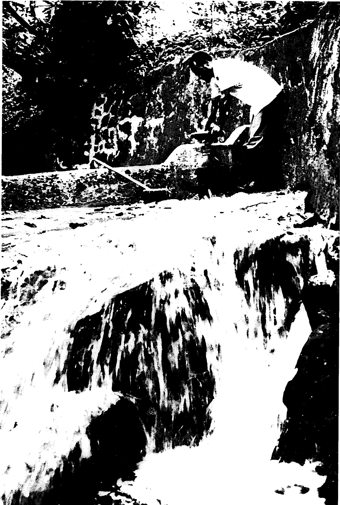
J. Vizcarra Brenner PAHO

A water caretaker in Saint Lucia diverts surface water to a reservoir for disinfection. Preparedness includes assessing the vulnerability of water treatment plants and reservoirs.