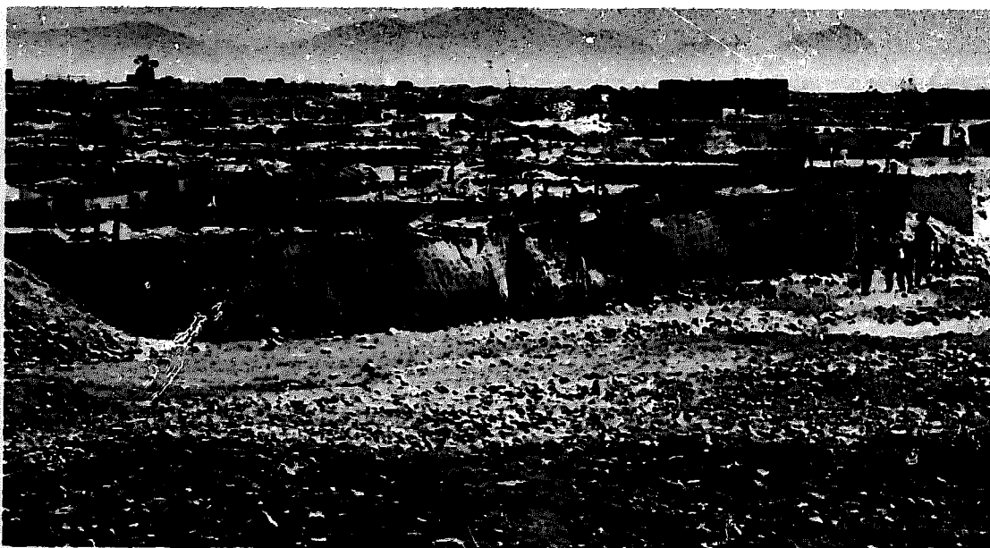
J. Vizcarra Brenner/PAHU

After the first two or three days following a disaster, more permanent shelters may become necessary. At this time, accommodating displaced persons should receive priority. To reduce the number of displaced persons who require shelter, they should be encouraged and assisted to stay with family or friends. As soon as possible, they should be helped to return to their own homes. If adequate resources exist to provide them with materials for constructing temporary shelter on their own property, this step should be taken. Wherever they locate, however, they must have access to water and food and a sanitary means of waste disposal.